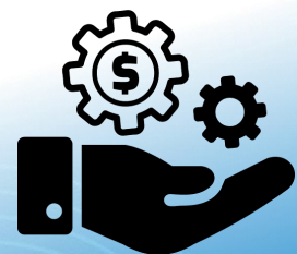
Finance and Professional