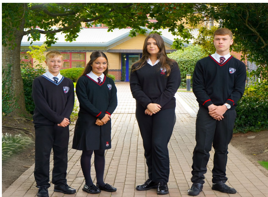
Millfield Science and Performing Arts: Examples of Acceptable Plain Black Trousers and Shorts*